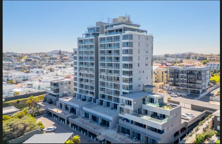
Table View at a glance